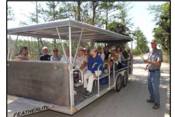
taken April 2, 2013