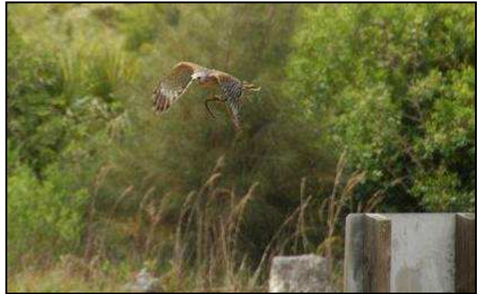
We received this email report and photo: FOF members Tony Marx and Malee Earle on Sunday, March 17 at 12:30PM saw a red-shouldered hawk catch a small snake at the pond in front of the ranger post. It alighted on the Post sign briefly to disable the snake then Malee got a quick photo as it flew over the parking lot with half its prey. Later that day they also saw a panther cross JSD about 2.5 miles north of Gate 12 but did not have time to take a picture.