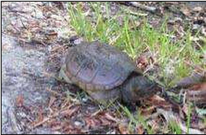
Sylvia Fulcher visited the Boardwalk early in March and caught this photo of a Common Snapping Turtle just moments before it entered the water.