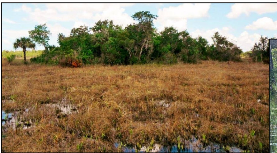
Typical small hammock on Lee-Cypress prairie to the west of Janes Scenic Drive.