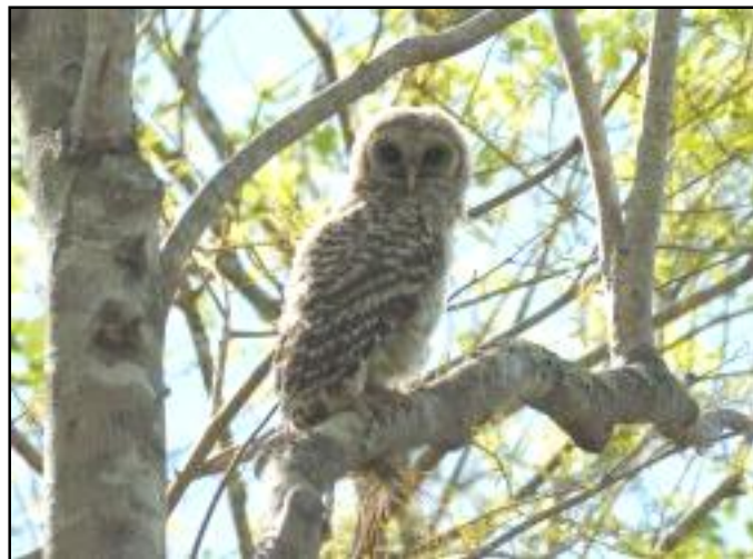
Baby Owl

The Park is looking for a couple to help in the office and visitor center next winter. In exchange, these special volunteers can park their trailer or RV near the Park office and hook into the utilities. If you are interested, contact Dennis at (239) 695-4593.