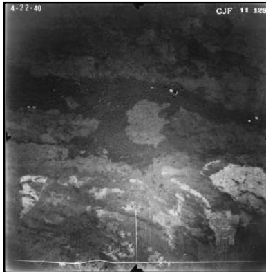
An old photo of the area taken in 1940.