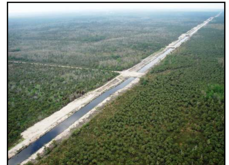
The canal before restoration.