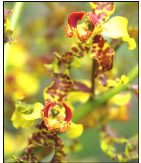
Cypripedium punctatum flowers

On behalf of all the collaborators, I would like to thank the Friends of Fakahatchee for financially supporting the cigar orchid restoration project.