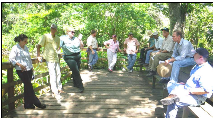
The meeting on June 16 at the Fakahatchee Boardwalk included a "blue ribbon" team from the Park Service. See the Update on page 2.