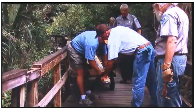
Snapshots from the DVD "Window into the Fakahatchee" showing the need for Boardwalk repairs.