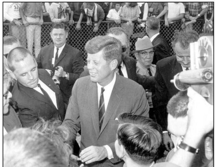
President John F. Kennedy was in Florida on November 18, 1963, just four days before he was assassinated in Dallas. While here, he visited Tampa and Miami.