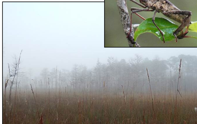
of the foggy December morning for the Christmas Bird Count and the Leaf-footed Bug.