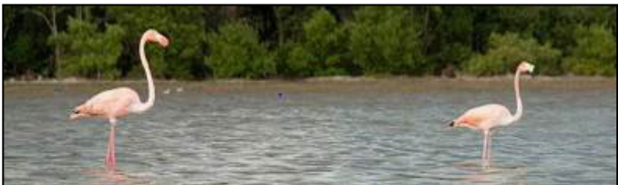
Flamingos have been seen near Flamingo! taken in Snake Bight in late November.