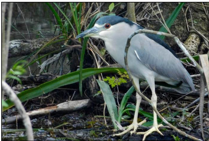
of a Great Egret and a Black-Crowned Night Heron on JSD. See MOZone above.