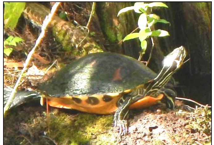
Red-Bellied Turtle seen at the Boardwalk.

A Florida Red-Bellied Turtle , stretched out on a log, appeared to be posing for those of us on the Boardwalk who were taking photos. Curious, I “googled” this reptile. These Red-Bellied Turtles are fairly large and can grow to 8-9” (males) and 14” (females) in length. Their carapace or top shell is olive-to-black, often with faded reddish brown patterning, and has a high dome shape. Their plastron or bottom shell is distinctly orange-to-red in coloration which gives them their common name. They are mainly herbivorous eating a variety of aquatic vegetation. Females will lay between 12 and 30 eggs in late spring to early summer. What I found particularly interesting was that the high domed and thick shell of these turtles is believed to be an adaptation which helps them survive alligator attacks which is a good thing as they are known to often bury their eggs in alligator nests!