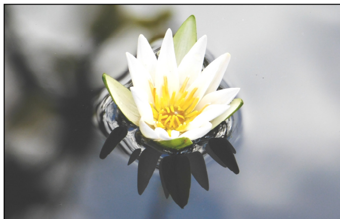
Photo of water lily at Ballard Camp.

I saw these two panthers on JSD at 9.10AM today about a mile north of the Mud Tram entrance. I think they were a mother and a juvenile. I watched them, about 150 yards from my position, for about 15 minutes through the zoom lens on my camera but for most of that time they were partly hidden by a bush and I could only see them because of the lens. I think they stayed hidden after they saw me.