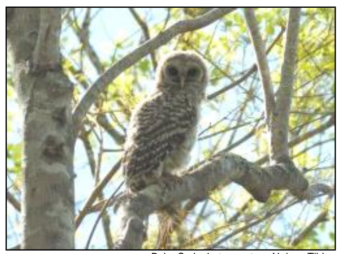
Baby Owl

The Park is looking for a couple to help in the office and visitor center next winter. In exchange, these special volunteers can park their trailer or RV near the Park office and hook into the utilities. If you are interested, contact Dennis at (239) 695-4593.