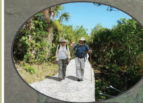
CRUSHED SHELL PATH