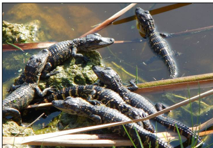
How many baby gators? See Boardwalk Report in left column.

As always, every day is different at the Big Cypress Bend Boardwalk so come often and spend some time. Binoculars will enhance your opportunity to see more. A Naturalist Guided Tour (reservations at www.orchidswamp.org ) will expand your understanding of the area and this amazing place. Also art supplies and/or a camera will allow you to capture more memories of your visit.