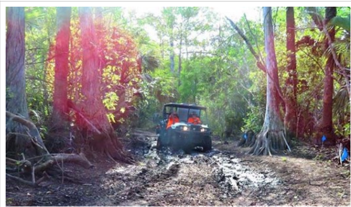
Howard Lubel and Clare Holden crossing through Hole in the Wall shows how the trail can vary from the dry, open prairie.