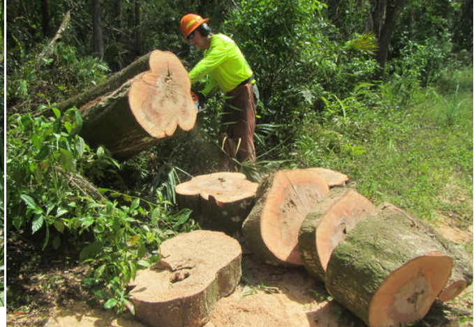
The team cut hefty slices of tree and rolled them off the tram trail.

You too can volunteer your time and talents! Visit orchidswamp.org/http://orchidswamp.org/support/how-to-volunteer/