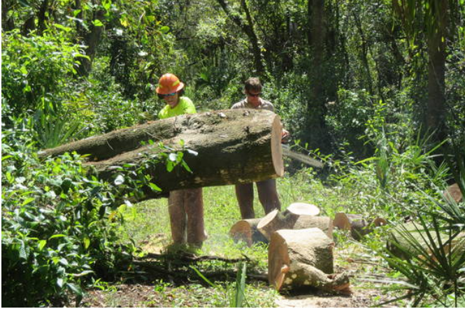
The bottom section lifted up several feet after the top heavy section was removed.