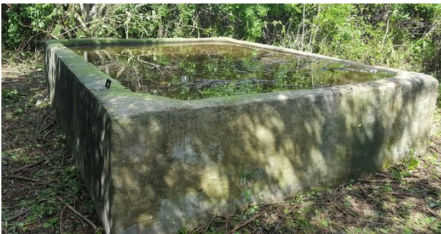
Cistern 3 – Still holding water 100 years after construction.