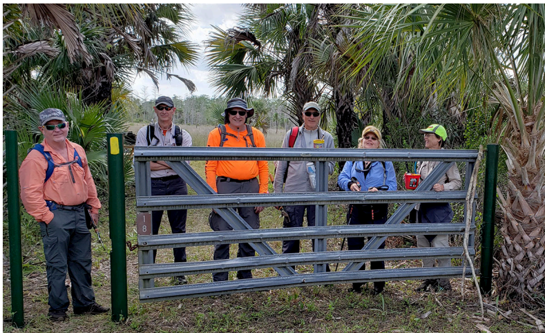
Members of the SW Alligator Amblers Chapter of the Florida Trail Association at the Gate 18 Trail in the heart of the Fakahatchee.

For the especially active, there is an exciting option in the Fakahatchee for a bike and hike day outing. Best yet, this route explores the unique Gate 18 hiking trail. To start your outing, stop at the Copeland Drive Ranger Station Visitor Center to pay the park entrance fee, check out the information kiosk, pick up a map, and chat with knowledgeable Visitor Center volunteers. Then turn onto Janes Scenic Drive to continue west for 6 miles to Gate 12 where you will park next to native Royal Palms.