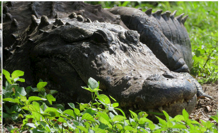
That's pretty close, Dino!