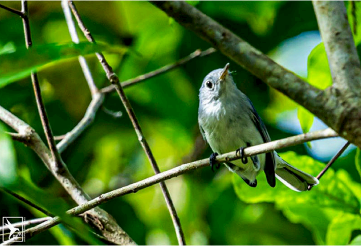
Blue-gray Gnatcatcher