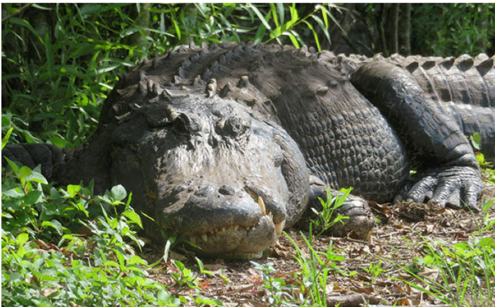
One handsome Fakahatchee dude.