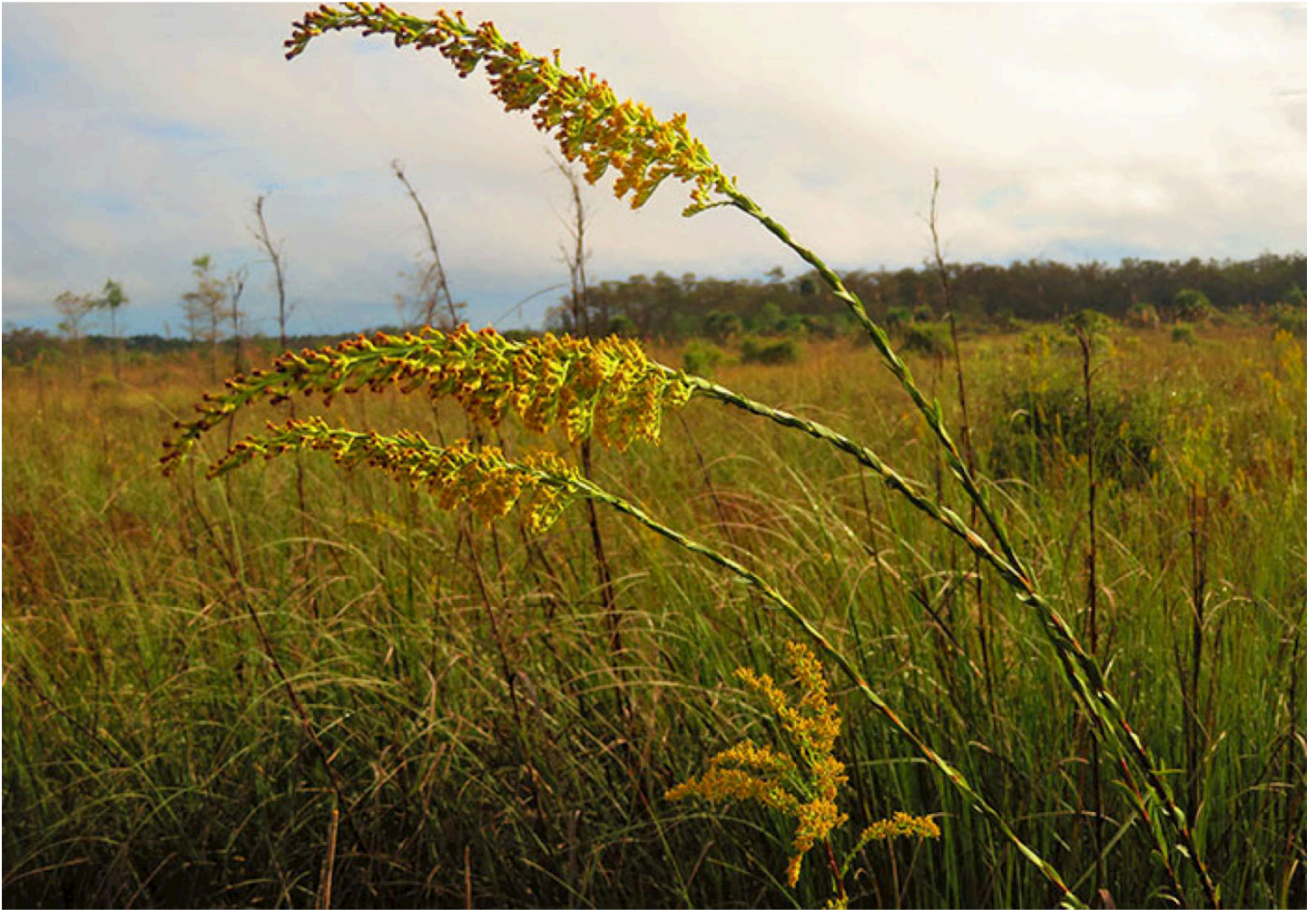
Seaside goldenrod ( Solidago sempervirens ) in the prairie.