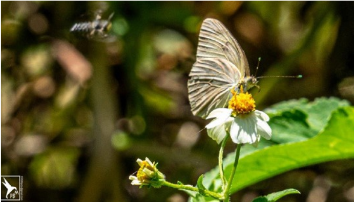
Great Southern White (Ascia monuste) : found around salt marshes, beaches, roadsides. Larval host plants are Virginia pepper grass ( Lepidium virginicum ), saltwort ( Batis maritima ), limber caper ( Capparis flexuosa ), and sea rocket ( Cakile lanceolata ).