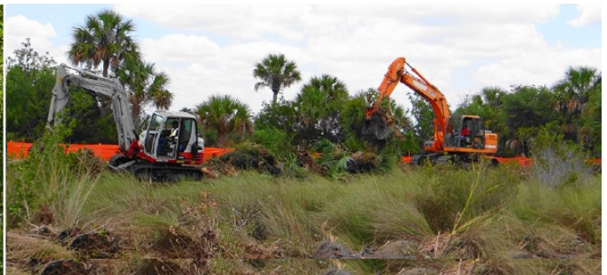
DEC has already started working at the new parking site.