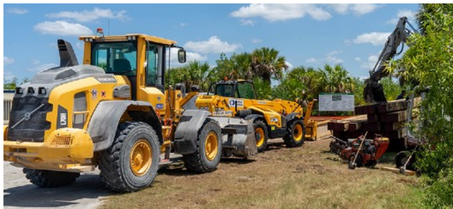
DEC Contracting Group Inc. equipment at the Boardwalk site.