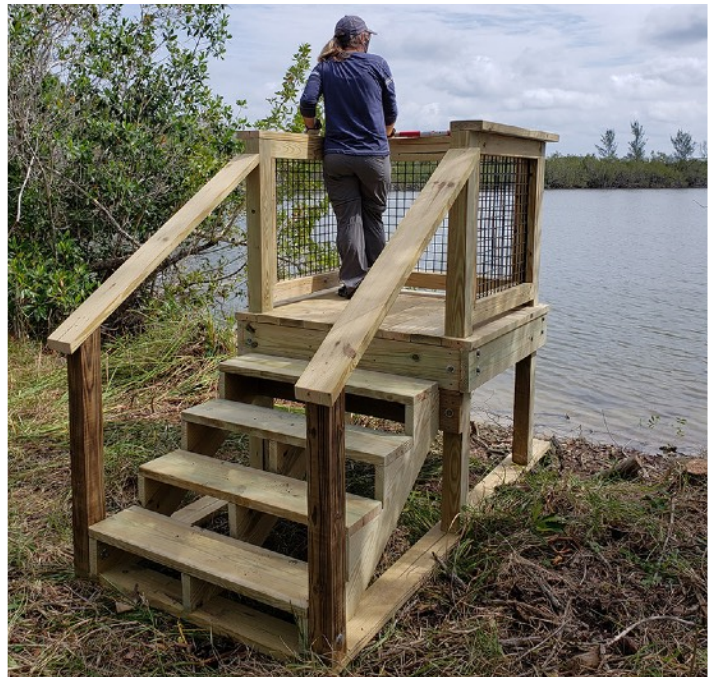
The new mobile observation platform was constructed and then installed at Green Heron Lake. Many thanks to the FOF Board, Park staff, and volunteers who made this possible.