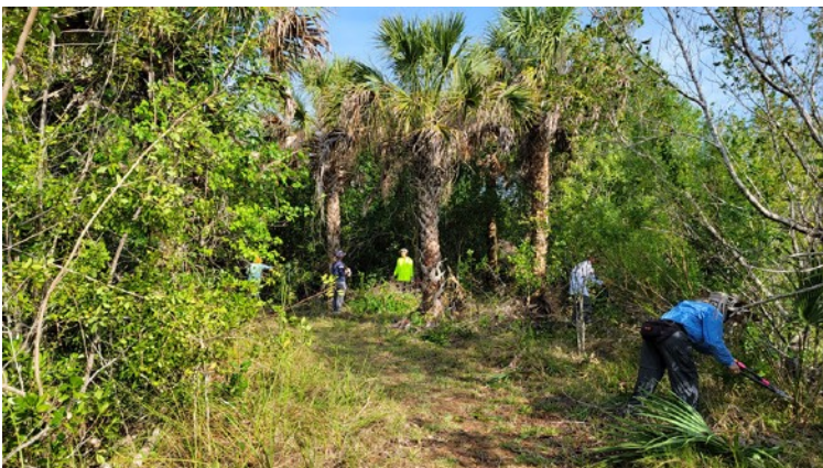
Nineteen volunteers, worked to clear out the overgrown trail leading to the site of the platform.