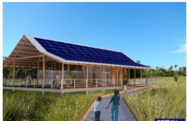
Corban Architects' rendering of the bridge (left), and the Interpretive Pavilion (right).