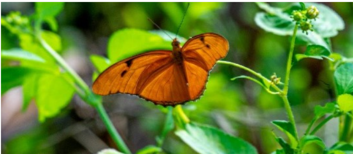
Julia Heliconian (Dryas iulia) : found along forest margins, open woodlands, shrubby sites, gardens, and parks. Larval host plants are corky-stemmed passion flower ( Passiflora suberosa ), many flowered passion flower ( Passiflora multiflora ).