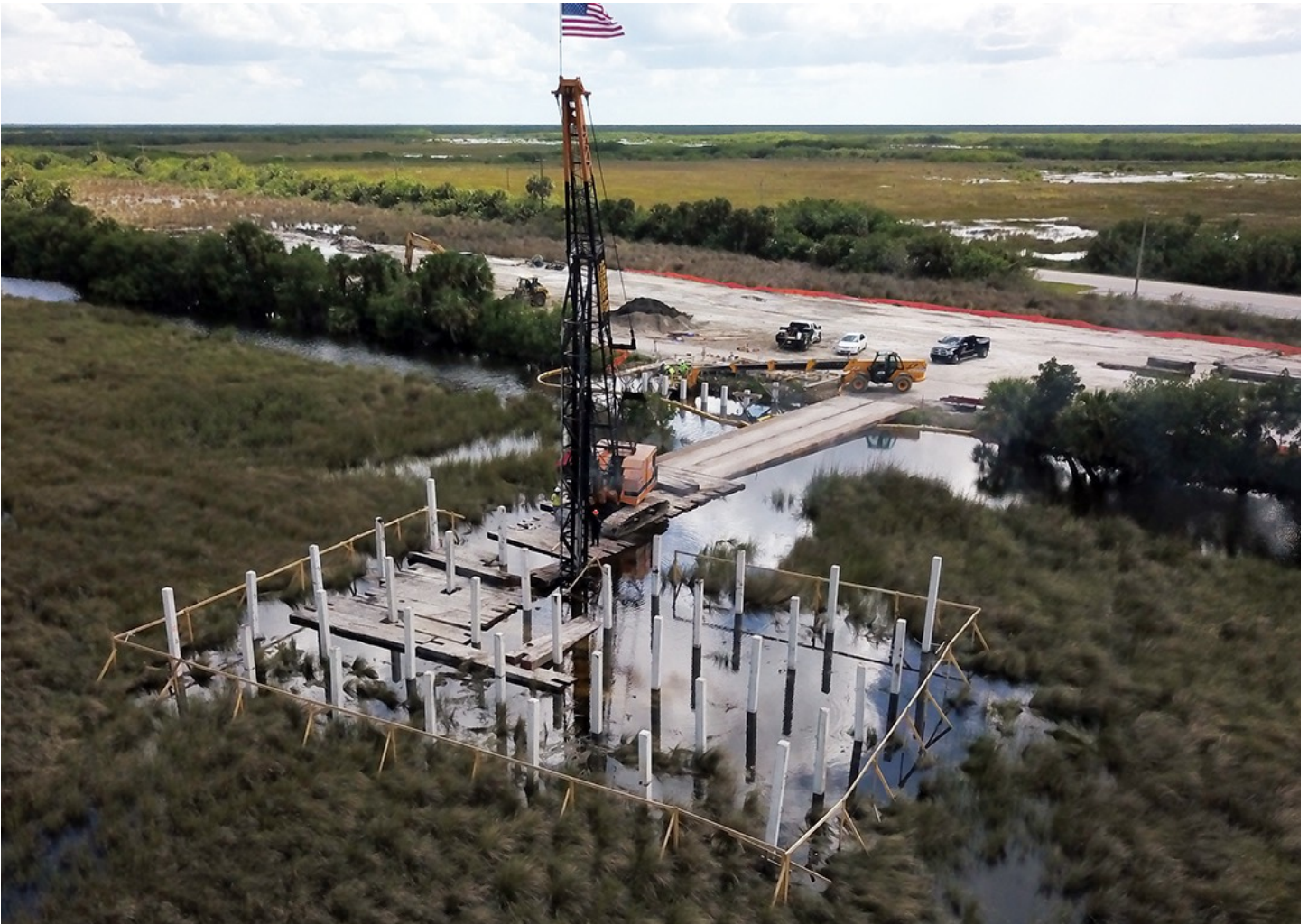
This aerial photo by Jay Staton, taken on September 29, shows the progress that has been made in positioning the pilings that will support the foundation of the Pavilion.