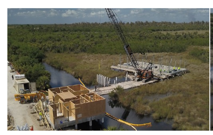
The Restrooms building is in the foreground with walls added. The Visitor's Pavilion in the background shows additional progress as well.

This labeled photo shows progress on the construction, with the Visitor's Pavilion in the foreground, Restrooms building in the middle, and the Parking Lot in the background.