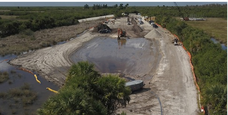
This long view from beyond the Parking Lot.