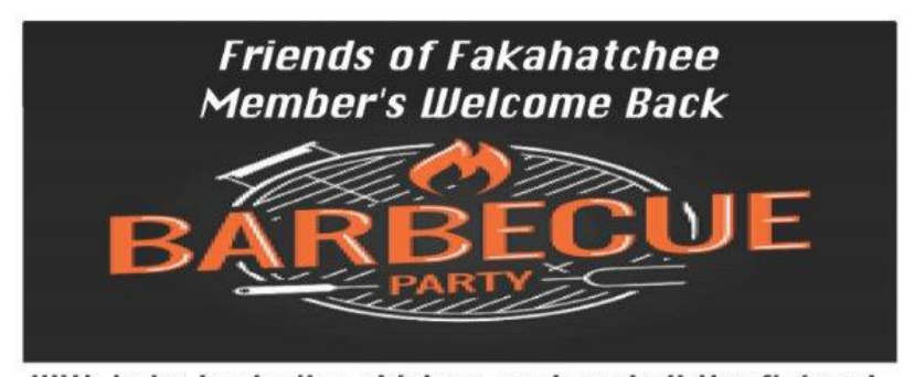
With baby back ribs, chicken, pork and all the fixings!