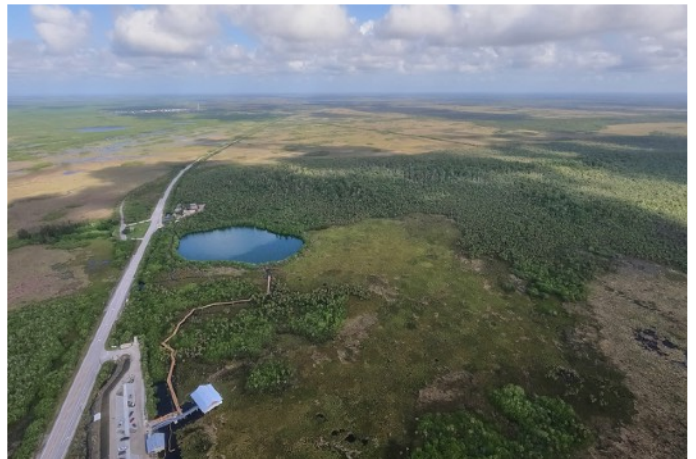
July 20, 2022, great progress is revealed in this shot.