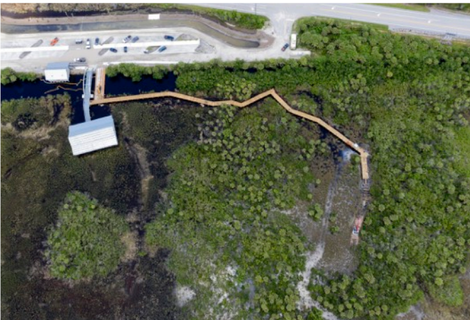
By June 2022 the boardwalk was on its way.