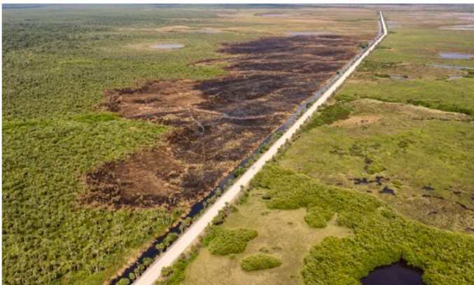
Aerial shots show the mosaic pattern of the Preserve landscape. Burned areas will soon regenerate with renewed vigor.