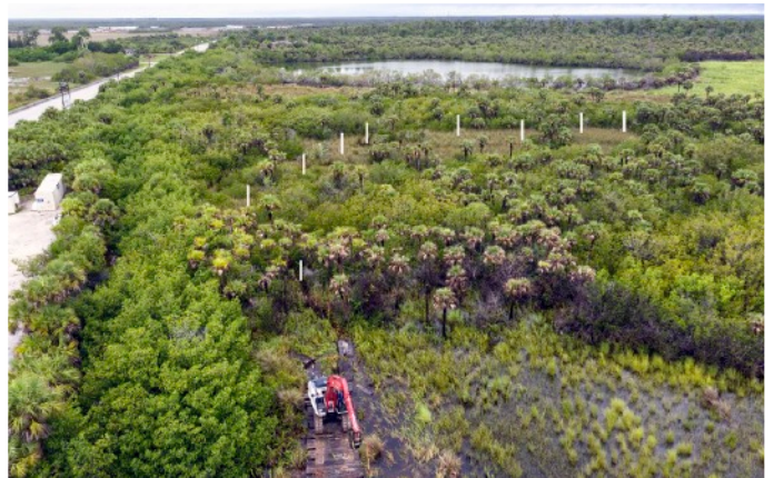
The project path toward Green Heron Lake as it appeared when work got underway. White rectangles show locations of flagging for boardwalk.