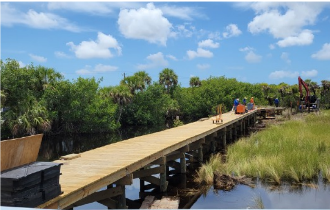
Constructing the boardwalk is demanding work, often accomplished over water.

Connecting the new Pavilion to the Big Cypress Bend Boardwalk seemed a daunting task, but as you will see below it is well underway!