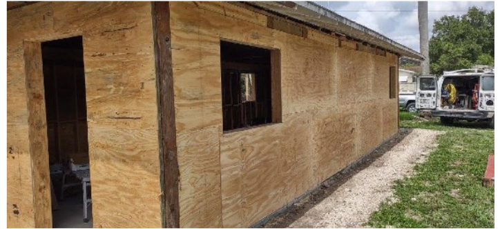
The Visitor Center, rebuilt from the inside out, nears completion.