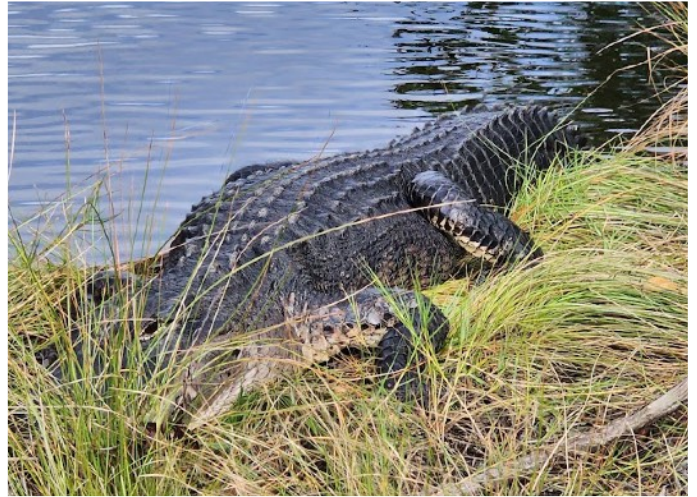
Does he think we can't see him? Alligator at Green Heron Lake.