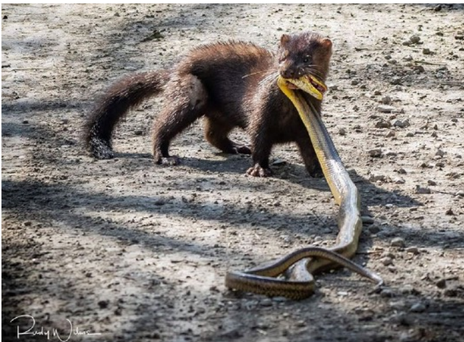
An Everglades Mink invites a Yellow Rat Snake for dinner.