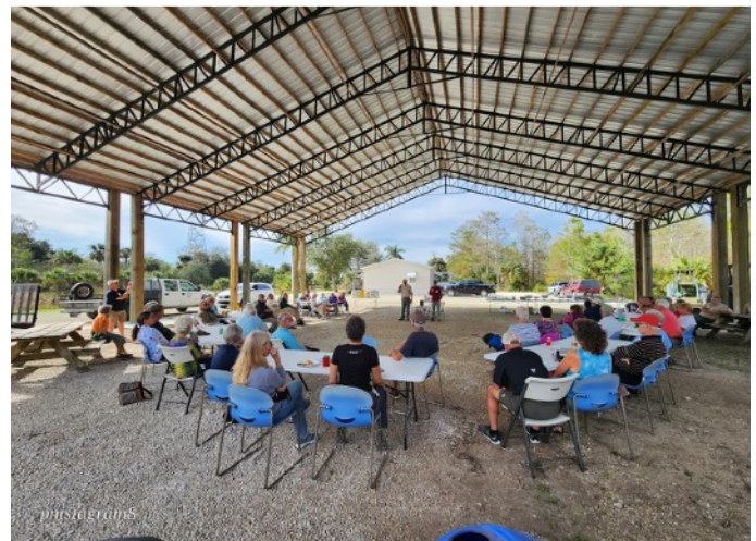
The new pole barn provided a spacious place for the members to enjoy the speakers.