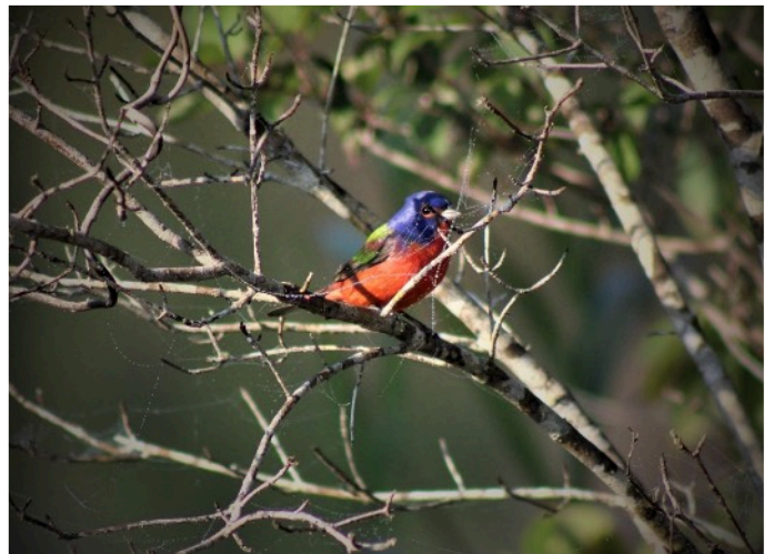
Painted bunting shows its true colors.