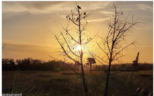
Beautiful sunset before the Green Comet show.