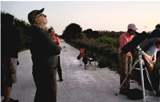
Attendees all waited with excited anticipation.