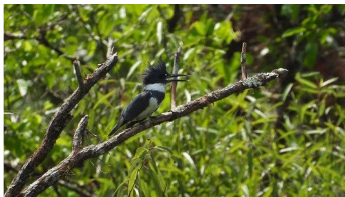
Belted Kingfisher, with a wingspan nearing two feet, will nest in burrows dug into a soft earth bank.