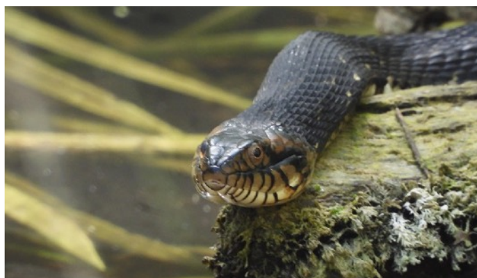
Close-up of Florida banded water snake.