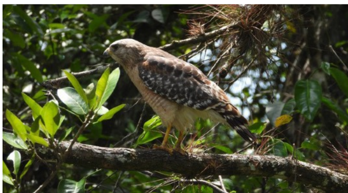
Red shouldered hawk possibly watching for small mammals, lizards, snakes, or amphibians for a meal.

Olga Ettrich recently photographed a variety of Florida wildlife while she was on a walk through the Fakahatchee. Thanks Olga for sharing with us! (Send us your photos and see them in the Ghost Writer.)