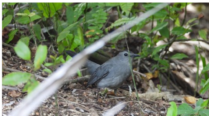
Gray Catbird, most likely migrating, makes a mewing-like sound.