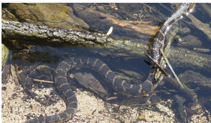
Non-venomous Florida banded water snake, which inhabits nearly all freshwater habitats throughout Florida, eat crayfish, fish, tadpoles, frogs, toads, salamanders, newts.