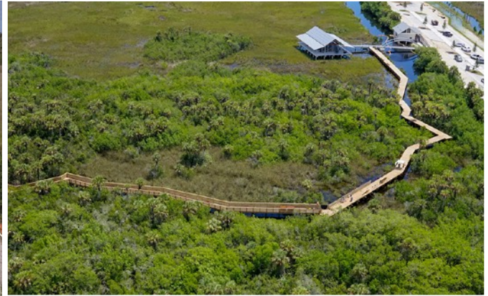
An Interpretive Pavilion on the other side of the canal with a bridge leading to the Boardwalk was an exciting addition to the original plans for the Boardwalk Expansion Project.