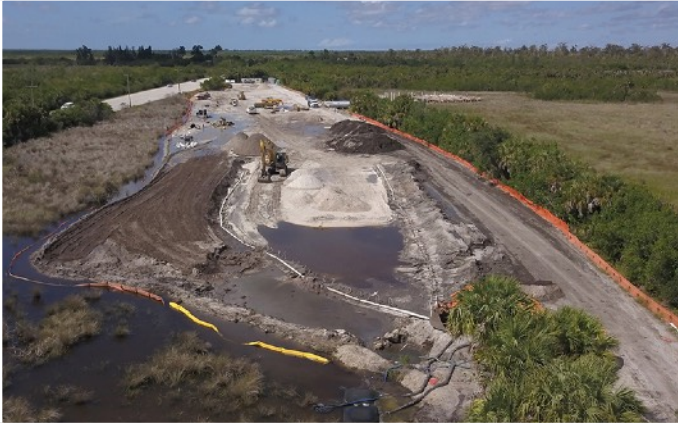
Massive amounts of 'behind the scenes' work was accomplished to build the restrooms, parking area, and access to the Interpretive Pavilion. Photo by Jay Staton, October, 2021.