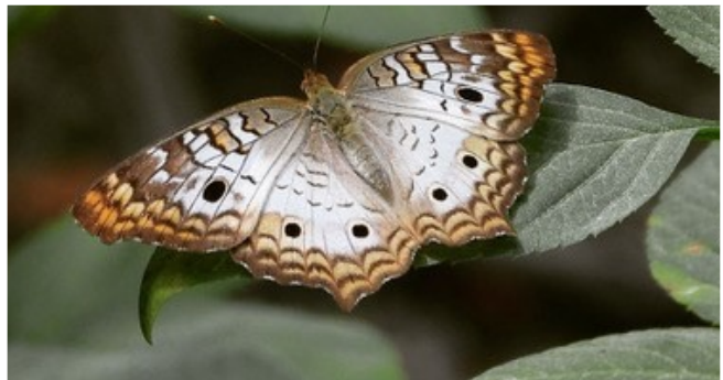
Two Eastern Tiger Swallowtails "mud-puddling" and a White Peacock sunning.