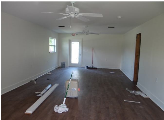
Interior, looking toward the front door.