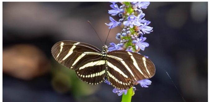
Is this Zebra Swallowtail sunning, nectaring, or simply resting on this Pickerelweed bloom?