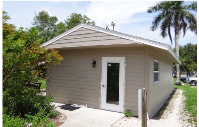
Front of the renovated Visitor Center.