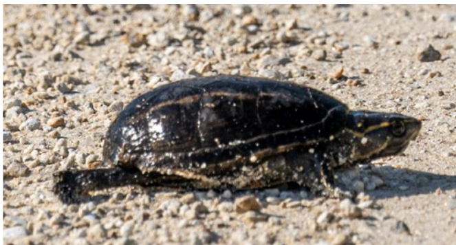
Phil asks us to give this tiny Three-striped Mud Turtle hatchling (and all turtles) a chance.