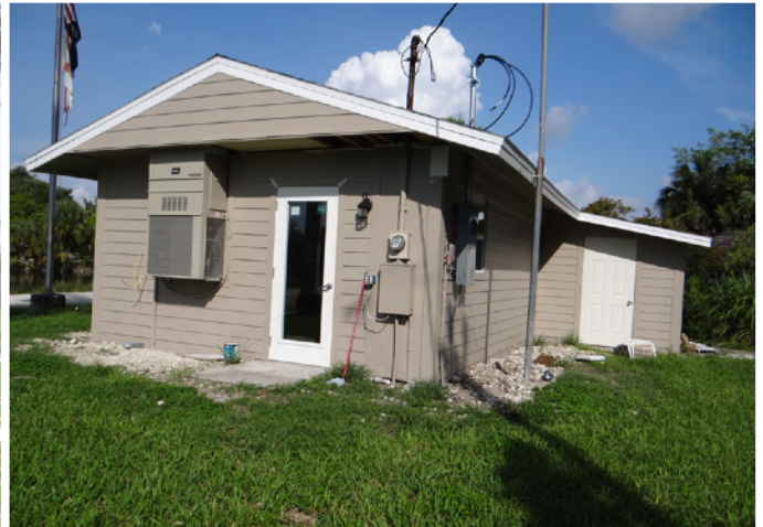
Rear of building