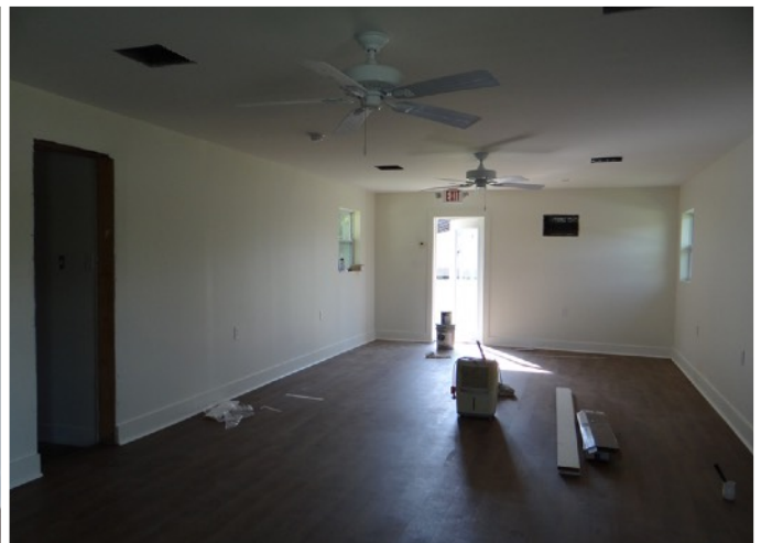
Interior, looking toward the rear of the building.