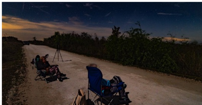
Night Sky Experience is relaxing fun – https://tinyurl.com/night-sky-tour.

Did you know we can organize a group tram tour for you? For a group of 12 or more please call the Friends office at 239-695-1023.