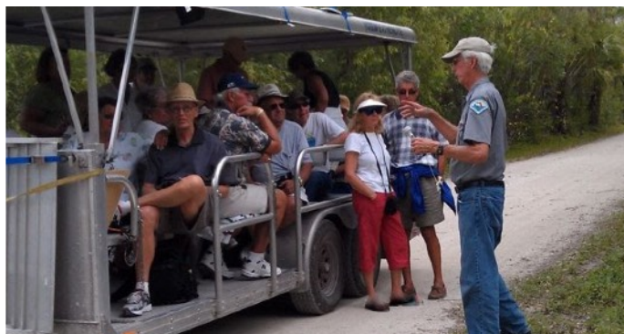
Friday Morning Tram Tours tickets are going fast– https://tinyurl.com/tram-tour