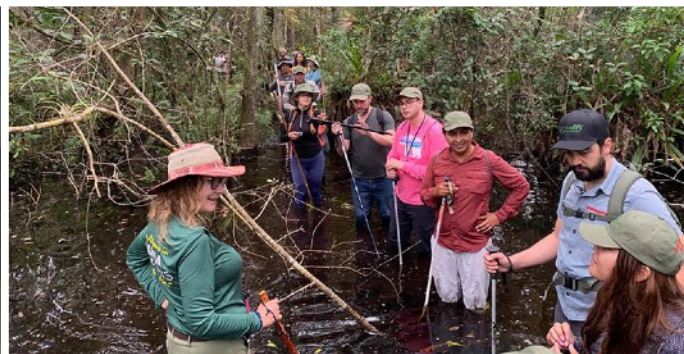
Advance Swamp Walk Saturday Tours start January 20 – https://tinyurl.com/swamp-walk .