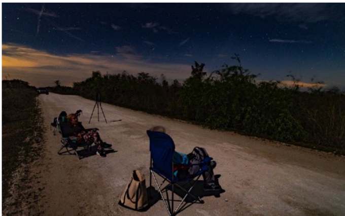
Night Sky Experience is relaxing fun – https://tinyurl.com/night-sky-tour.