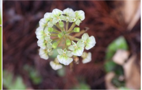
Shadow Witch orchid ( Ponthieva racemosa ) is a terrestrial that grows among the leaf litter of forest hammocks and swampy areas.