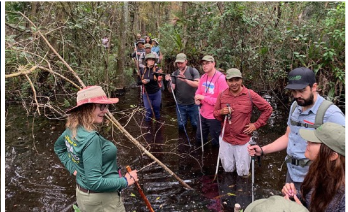
Advance Swamp Walk Saturday Tours start January 20 – https://tinyurl.com/swamp-walk .