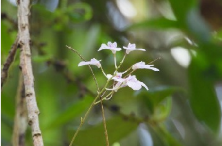
Delicate ionopsis ( Inopsis utricularioides ) also called delicate violet orchid, is an epiphytic orchid, native to the warmer parts of the Americas. It is listed as endangered in Florida.

A recent trip to the Fak rewarded photographer Olga Ettrich with views of several orchid species. We are fortunate she shared these photos from her trip.