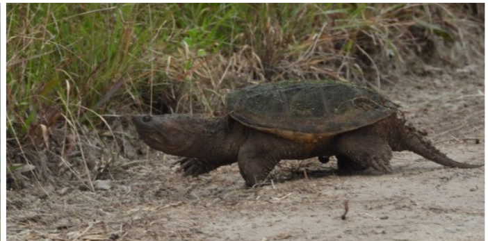
Common Snapping turtles ( Chelydra serpentina ) like this one have a powerful bite and are not friendly. Its long neck can reach halfway back across its body, so attempting to pick one up is ill-advised. Note also that picking it up by its tail can injure or kill it, so please keep a respectful distance like Olga did.