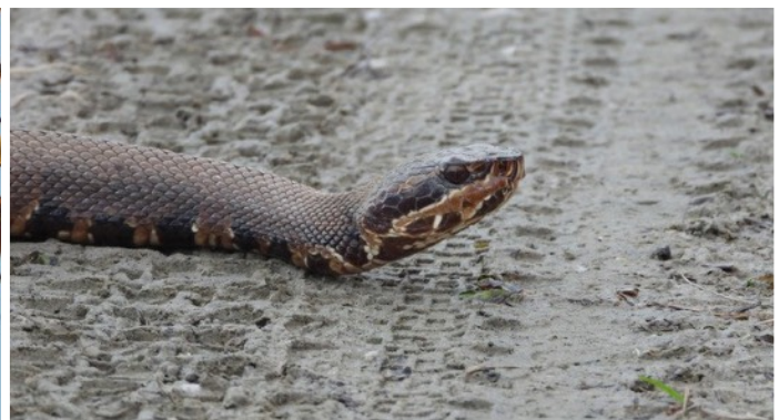
Brown water snakes ( Nerodia taxispilota ) are not dangerous to people nor pets, but they will readily bite to defend themselves if intentionally molested. These snakes are not aggressive and avoid direct contact