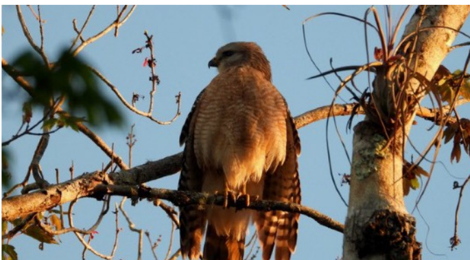
Red Shouldered Hawk ( Buteo lineatus ) searches for prey while perched on a treetop or soaring over woodlands. Had this fluffy one spied some lunch?