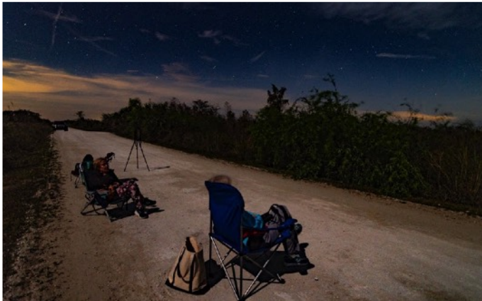
Night Sky Experience is relaxing fun – https://tinyurl.com/night-sky-tour.

Go directly to the FOF Eventbrite page for each tour by clicking on its link below.