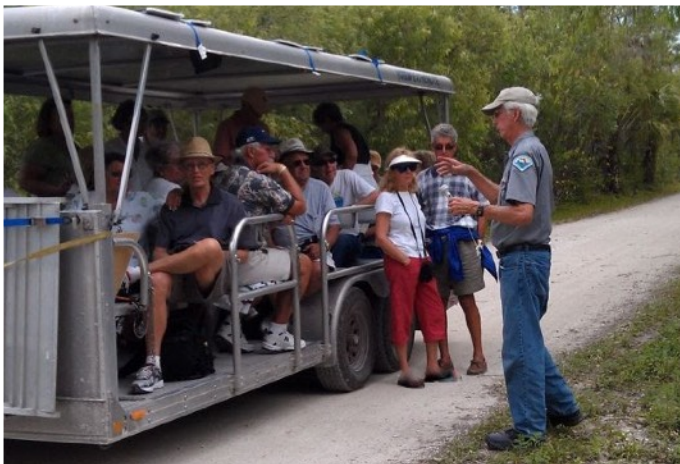
Friday Morning Tram Tours tickets are going fast– https://tinyurl.com/tram-tour Photo by Francine Stevens.