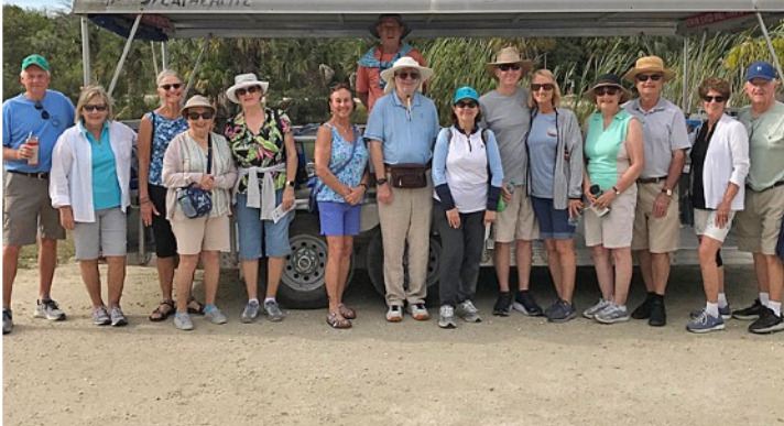
Glades Country Club enjoyed a private tram tour on a beautiful day in January.