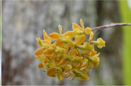
Dingy Flowered Star orchid ( Epidendrum amphotomum ) one of the most common epiphytic orchids in south Florida swamps, is epiphytic on a wide variety of trees in strand swamps.