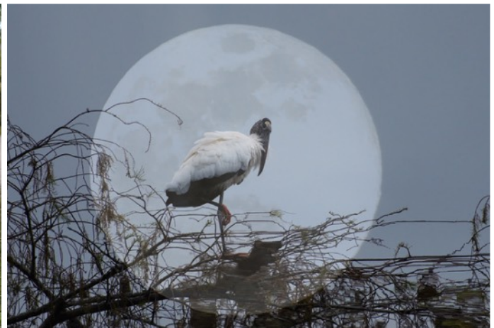
We were able to add a few more seats for the Moonlit tram tour – http://tinyurl.com/moon-lit-tour