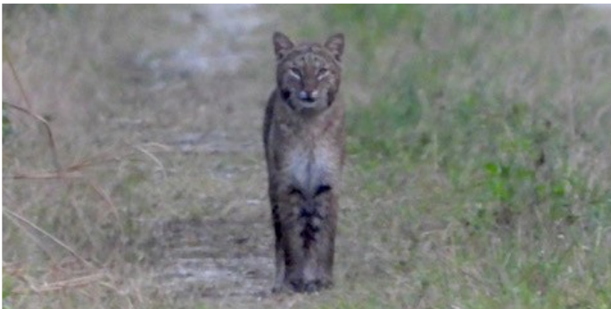
This Bobcat ( Lynx rufus floridanus ) was at full attention. Bobcats can climb trees or swim in search of food, and they are often shelter and sun themselves among branches. They are carnivores and will eat whatever they can catch.