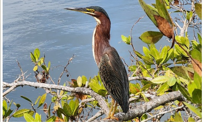
Green Heron at the new Boardwalk site.