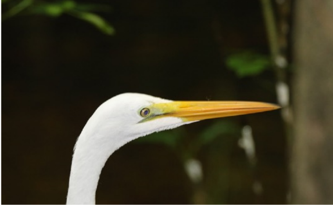
Great Egret headshot.