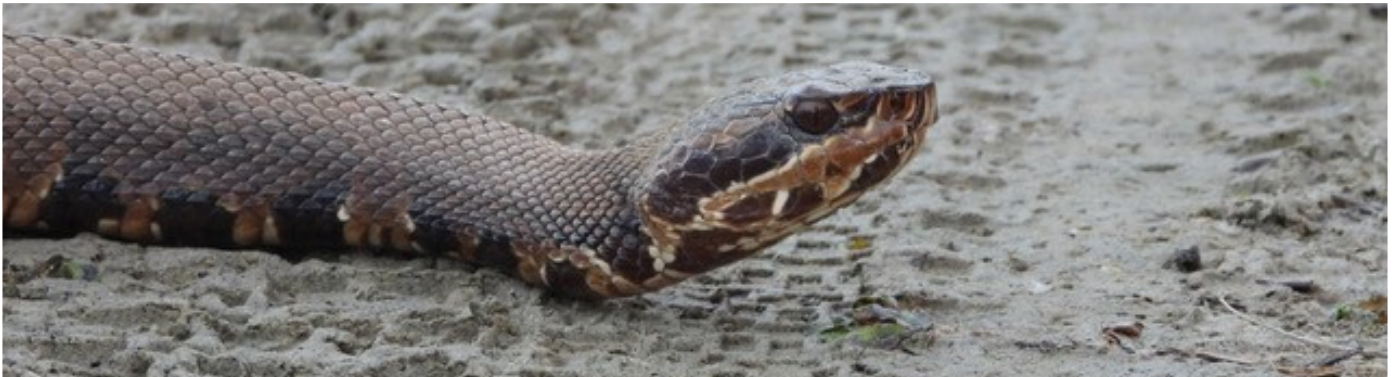
In last month's Ghostwriter this Cottonmouth snake was incorrectly identified as a water snake. Our apologies!