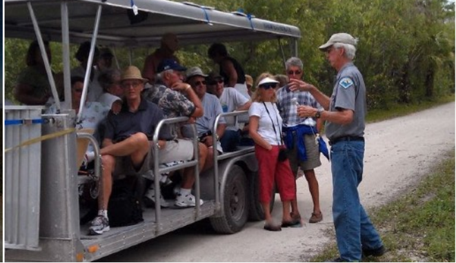
This season's final Friday Morning Tram Tour will be April 12.