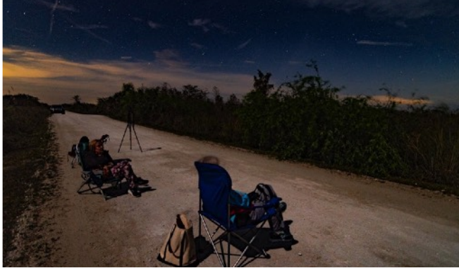
This season's final Night Sky Tour Experience will be Saturday, April 27.

Did you know we can organize a group tram tour for you? For a group of 12 or more please call the Friends office at 239-695-1023.