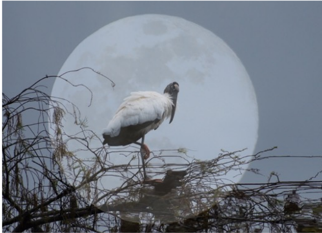
For scheduled Moonlit Tram Tours through April 2025. To select a date and purchase tickets visit https://tinyurl.com/FOF-moonlit-tram .