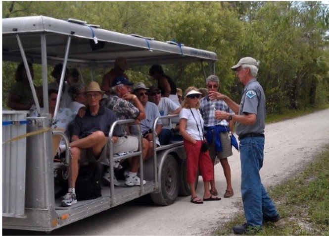
Interpretive Tram Tours are scheduled each Friday morning through April. Visit this link https://tinyurl.com/FOF-interpretive-tram to purchase tickets.