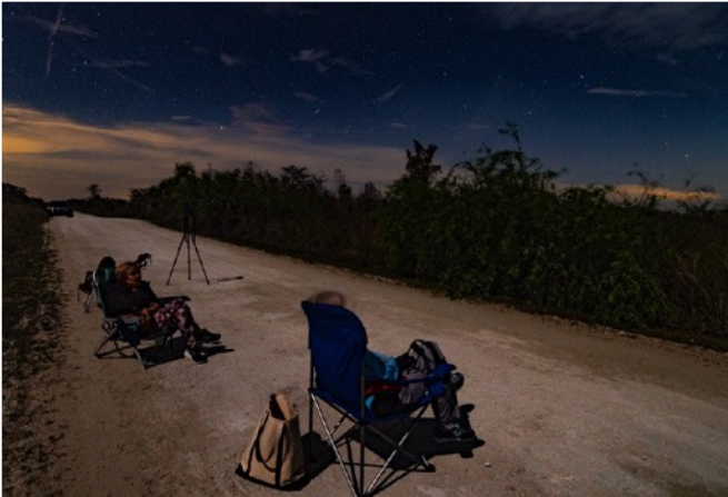
The Night Sky sessions offer limited access to the Fakahatchee after park hours to observe interesting formation of planets and stars. Night Sky sessions are offered monthly through April 2025. Use this link https://tinyurl.com/FOF-nightsky to see dates and purchase tickets.

Thanks to the commitment of our tour volunteers, tickets continue to be on sale on Eventbrite. To view the complete schedule of tours through April 2025 and to purchase tickets, please visit the Friends' Eventbrite page at https://tinyurl.com/FOFtours . To read a full description of each tour visit the Friends' Official FOF Tours and Events webpage at https://orchidswamp.org/adventures/ .