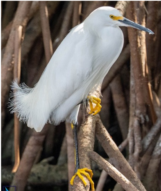
This Snowy Egret (Egretta thula), with 'golden slippers' and wispy plumage posed nicely for the camera.