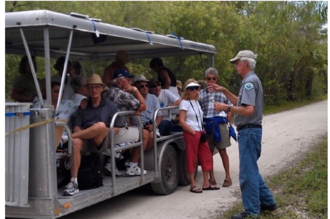
Interpretive Tram Tours are scheduled for each Friday morning through April. Visit this link https://tinyurl.com/FOF-interpretive-tram to purchase tickets.