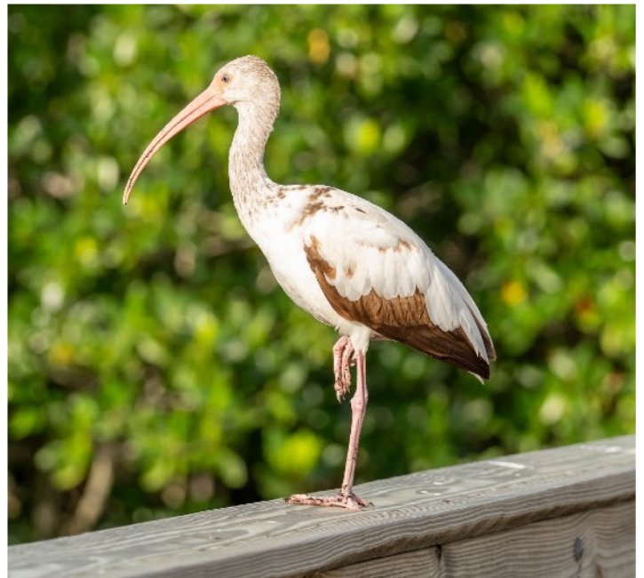
Another juvenile in the Fak. White Ibis (Eudocimus albus) are found from the southern half of the US East Coast, along the Gulf Coast states, the Caribbean, and Central America.