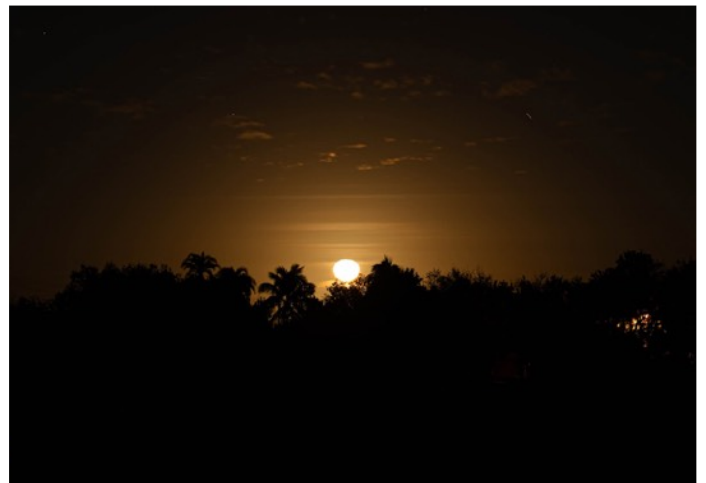
Phil McGuire's Night Sky on Feb 15 was another success with 17 participating. The clear sky was illuminated with millions of stars. The group even stayed late to observe the moon rise on the horizon.