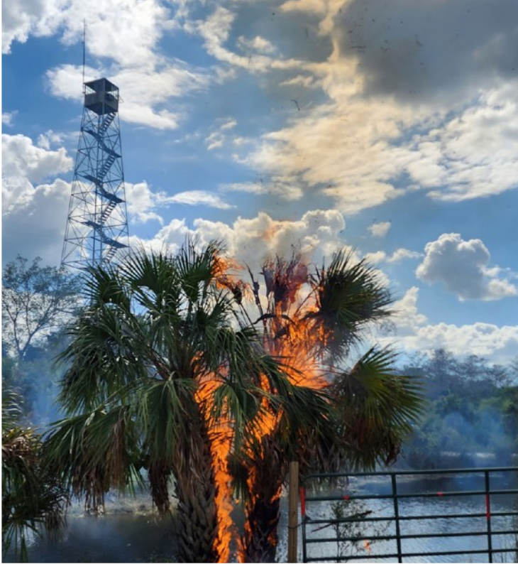
This burning palm will recover because it is fire-adapted.