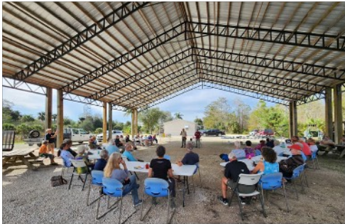
MEMBER'S ANNUAL MEETING & Volunteer Appreciation picnic