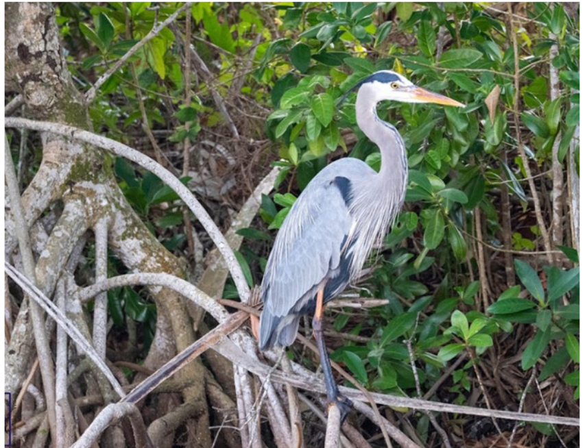
Adult Great Blue Herons (Ardea herodias) are 3-4 feet tall and live, breed, and nest year-round in South Florida.