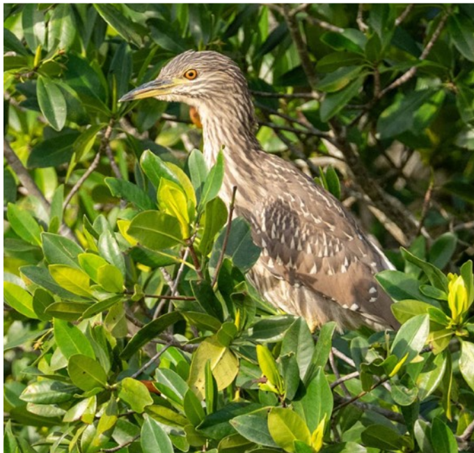
A juvenile Black Crown Night Heron (Nycticorax nycticorax) seems to watch the photographer. They are medium-sized herons found over a large part of the world.