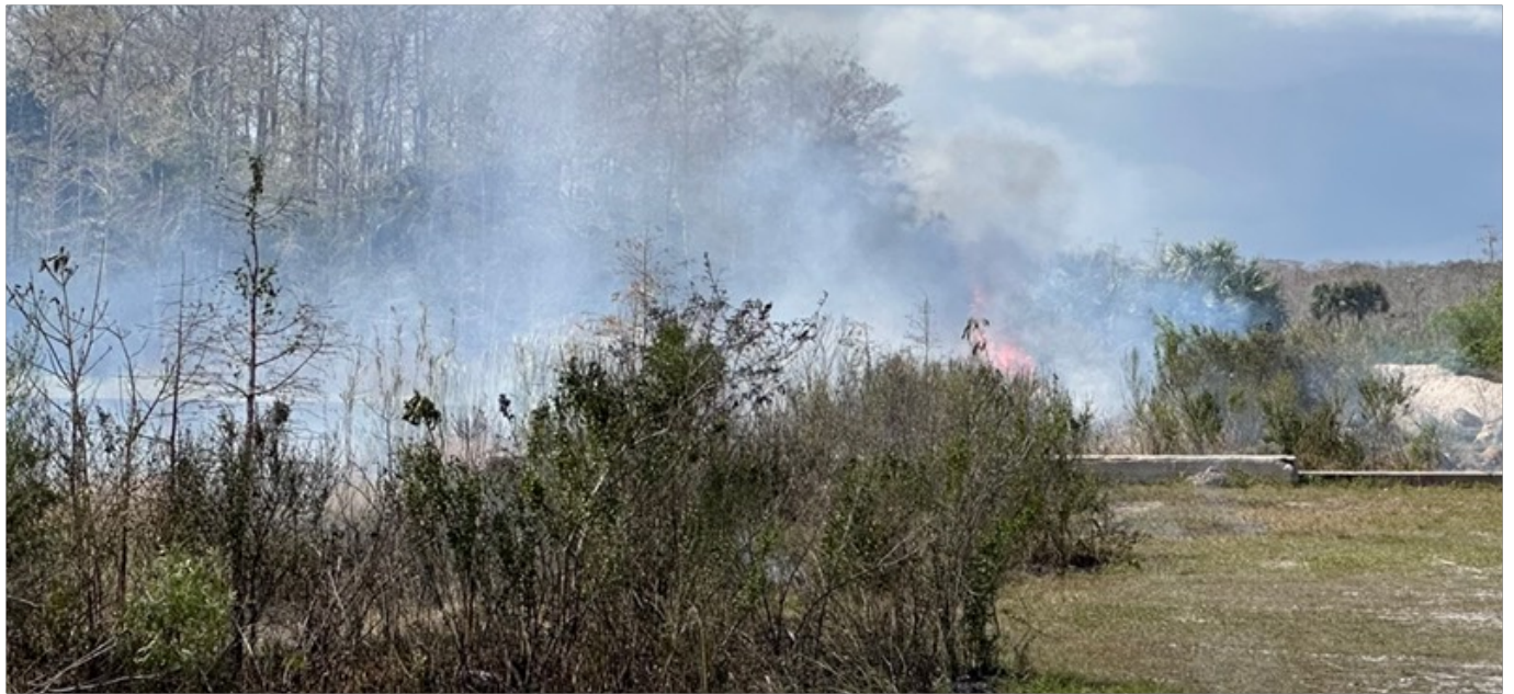
While guiding a tram tour, Carol Spagnolo captured a photo of this scene at the prescribed burn site.