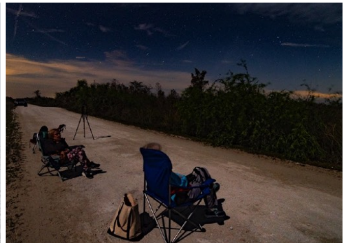
The Night Sky sessions offer limited access to the Fakahatchee after park hours to observe interesting formation of planets and stars. Night Sky sessions were offered monthly through April 2025. For tickets, go to https://tinyurl.com/night-sky-Fak .