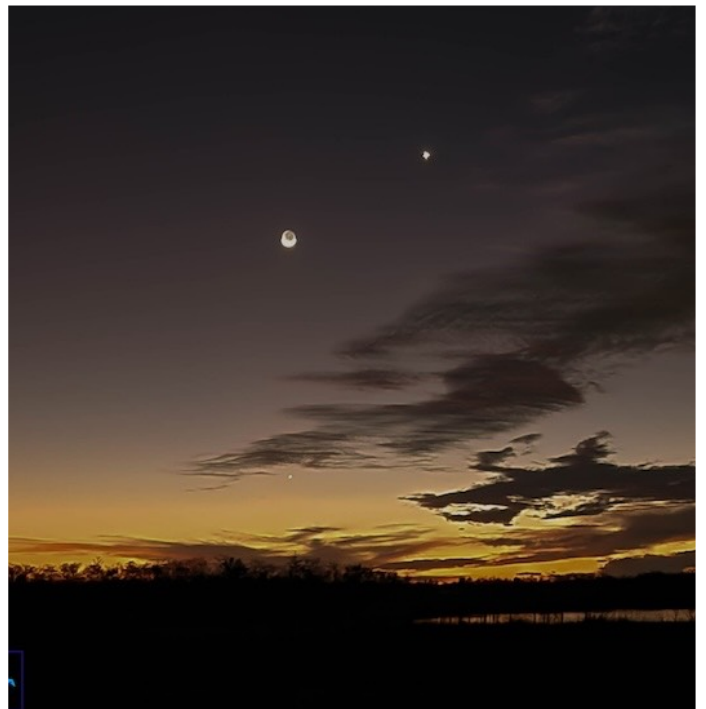
The March night sky reveals its wonders.