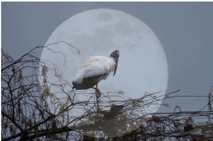
To take the last Moonlit Tram Tours April 12, 2025 visit https://tinyurl.com/FOFmoonlit-tram .