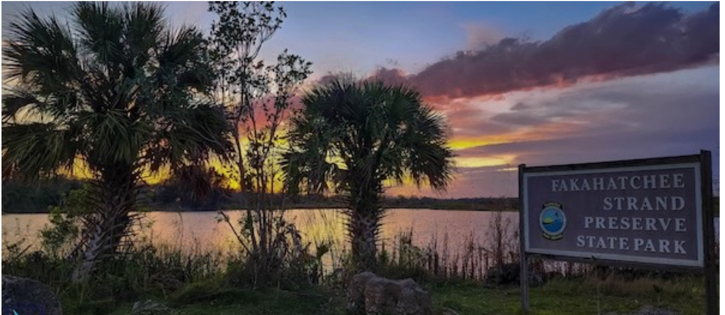
A beautiful sunset sets the stage for nightfall.