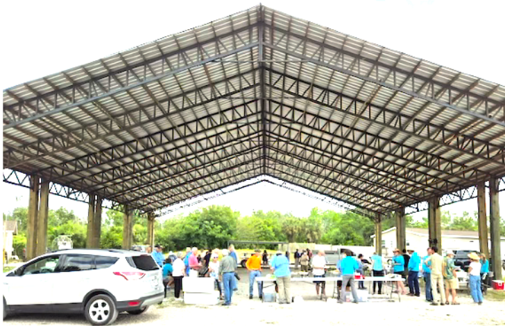
Everyone is comfortable under the pole barn.