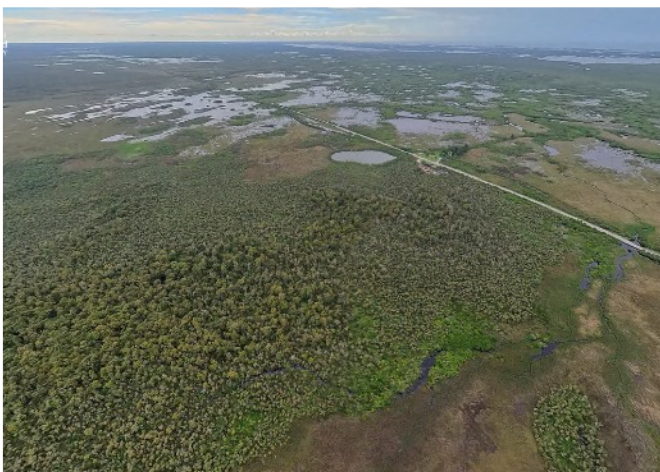
South-east view of the Fakahatchee Strand, Green Heron Lake, and the Boardwalk.

In September, aerial photographer and pilot Ralph Arwood provided Board member Deborah Jansen with an aerial tour over the Boardwalk. Both photographs also include glimpses of the River of Grass. Heartfelt thanks to Ralph for sharing these gorgeous views!