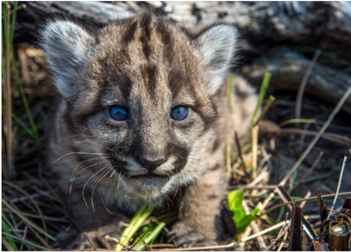
K408 as a kitten March 13, 2014.