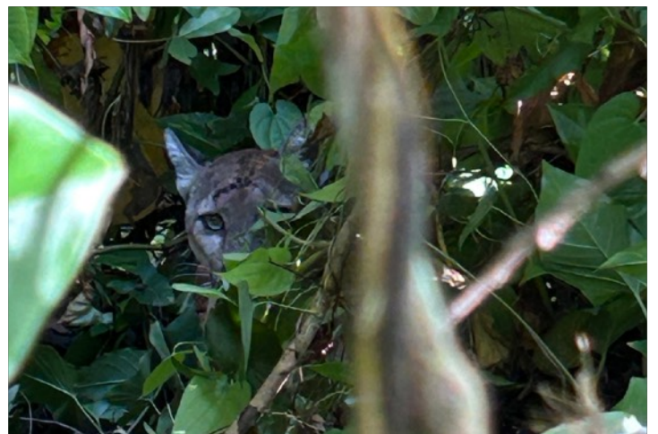
K408 was located in vegetation in Copeland August 29, 2025.

They tranquilized her and took her to Naples for initial examination and then took her to ZooTampa for care and further diagnosis. Initially, it appeared that she had a laceration on her forehead and could lift her head to eat but what was concerning was her inability to stand. An x-ray showed that she had a fractured vertebrae in her neck. She died before further evaluation of her condition could be completed.