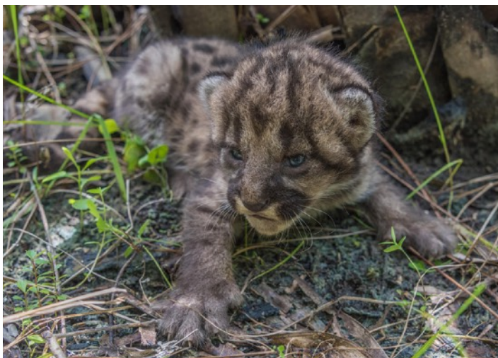
Athena, K480, at den in June 2017, K408's younger sister.

We were able to trace K408's family tree all the way back to a female puma (the western name for a panther) from Texas released into eastern Big Cypress in 1995. TX107 was K408's great grandmother. In 2006, her grandmother was collared and named FP93 (the 93rd panther collared in South Florida). In 2013, her mom was collared and became FP220. They all spent most of their lives in eastern Big Cypress. And, Athena, the Florida panther who lives at the Naples Zoo, is K408's younger sister born in 2017.