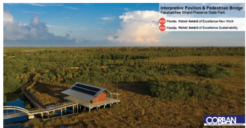
The award winning new Boardwalk and Pavillon.