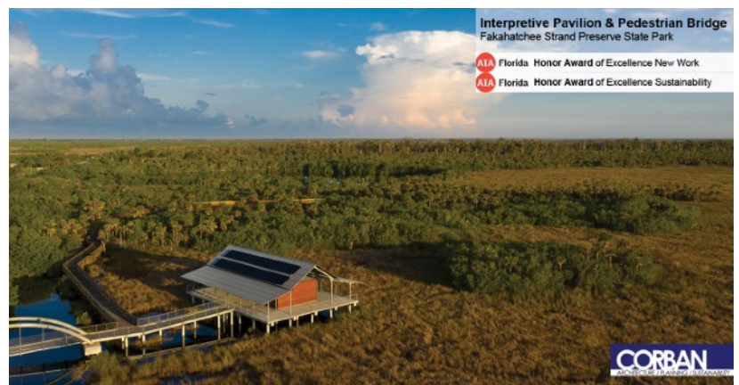
The award winning new Boardwalk and Pavillon.