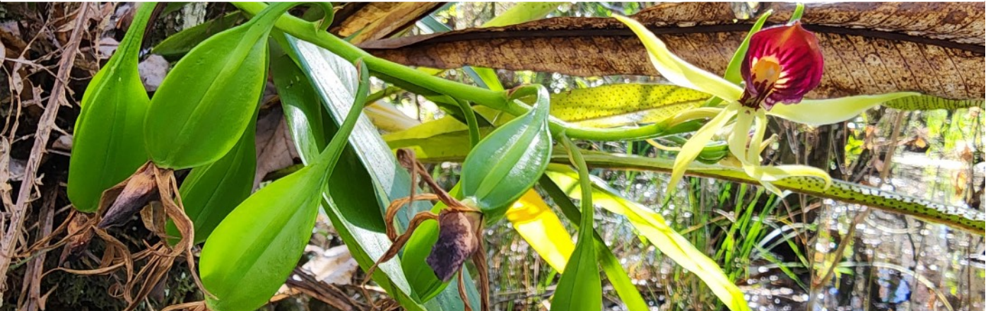
This beautiful Clam Shell orchid is a state-listed endangered species.