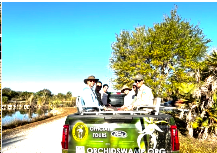
Swamp walkers load up into the back of the Friends' truck for a more immersive experience.