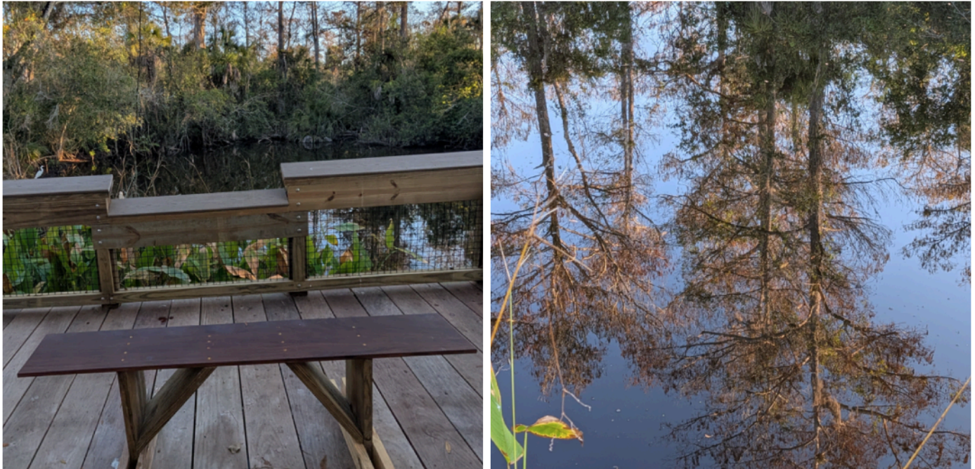
This viewing location (left) and reflective view (right) from that access point of the alligator pond.

The FDEP has done a splendid job with the boardwalk restoration. All new wood planks and handrails make for a very even hiking experience and the handrails have been made compliant for those enjoying the trail in wheelchairs. For example, see the viewing location and the reflective view of the alligator pond (below), taken from that visual access point.