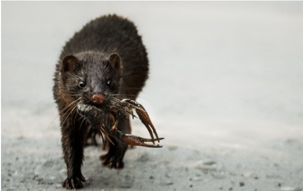
An exciting image of a threatened Everglades mink with a meal of a crayfish.