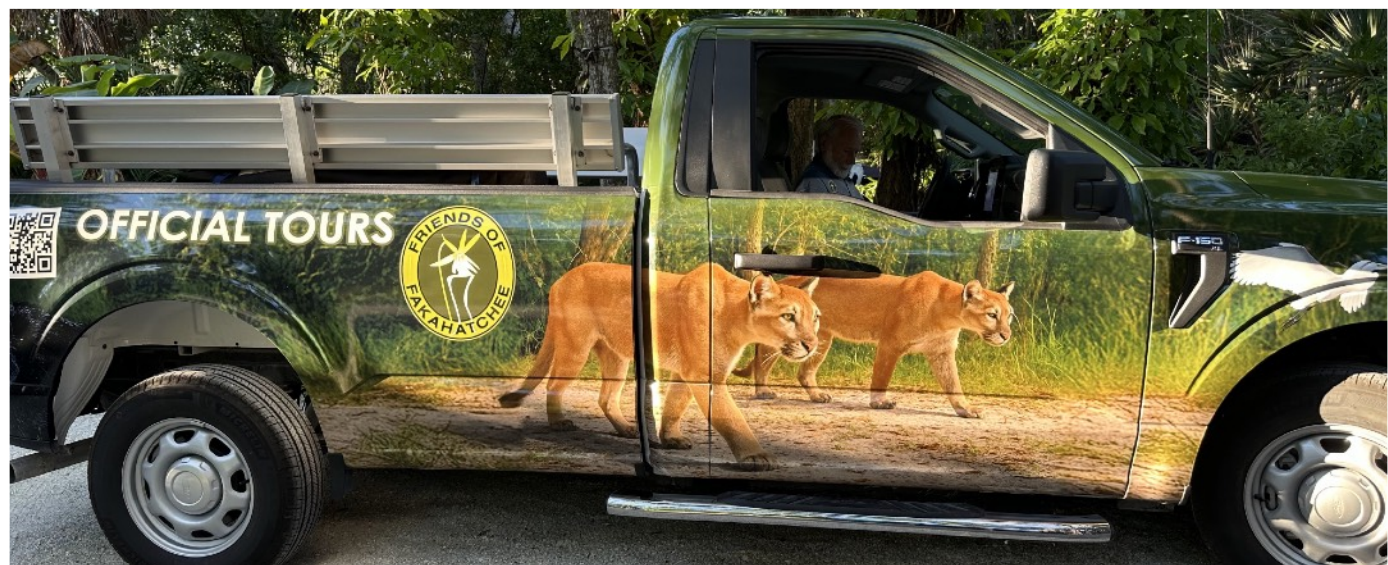
It's a beauty!