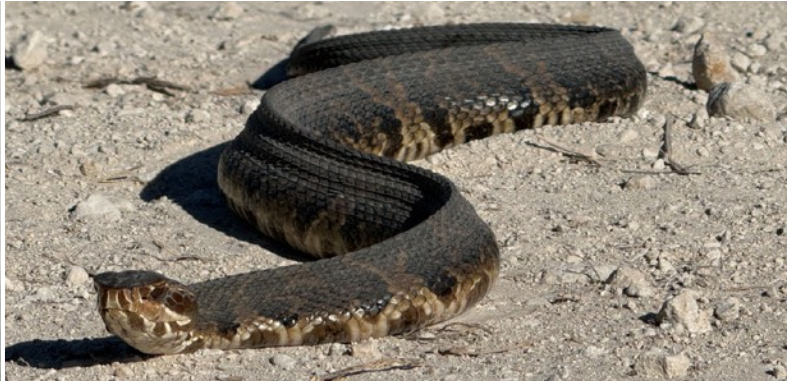
Cotton mouths may be found in every county in Florida – if you go looking!