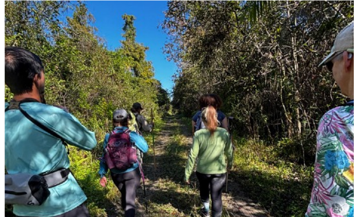
It was a lovely, short walk to the Swamp Walk location.