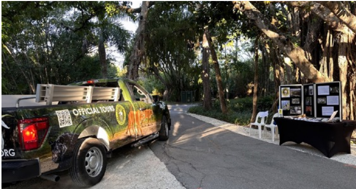
Left: Official Tours truck with new wrap and the FOF display at the Panther Festival.