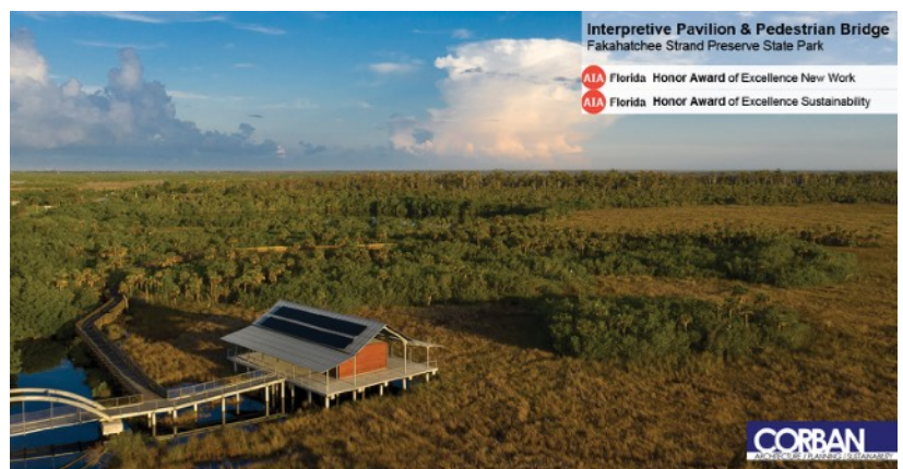
The award winning new Boardwalk and Pavillon.