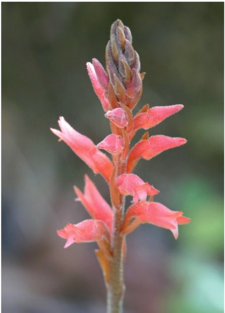
Fakahatchee Beaked Orchid.