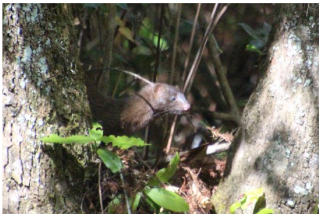
Everglades mink.

Many thanks to the intrepid photographers who shared these glimpses of the abundant species that flourish in the Preserve. Photographers noted in the captions.