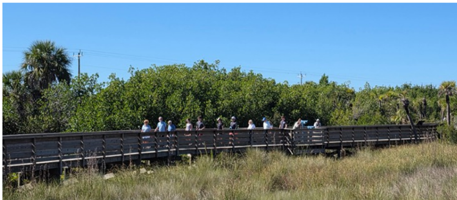
Busy boardwalk.