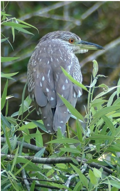
Juvenile Yellow-Crowned Night Heron.