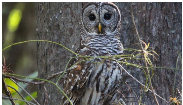
Barred Owl.