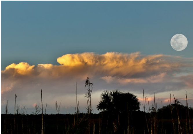
Last chance for our popular Moonlit Tram Tours. Get your tickets and more information at Eventbrite, https://tinyurl.com/moonlight-tram