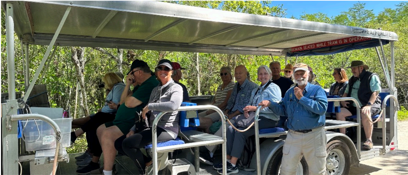
More than 1,000 people have experienced the Fakahatchee on our enjoyable Friday Morning Interpretive Tram Tours. Tickets and details at Eventbrite, https://tinyurl.com/FOF-tram-tour .