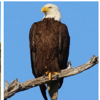
Boardwalk Eagle.