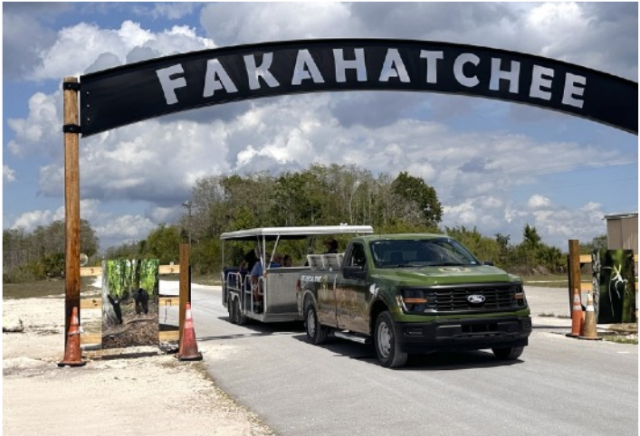
The Friends' tram tour enters Janes Scenic Drive beneath the new sign.

With financial support from the Friends, the fabrication and installation of an entrance sign for Fakahatchee on Janes Scenic Drive was completed at the request of the Park Manager. The new sign establishes a clear identity for the Preserve and fulfills a longstanding requirement. Visitors have already begun to photograph themselves at the Fakahatchee sign upon arrival.